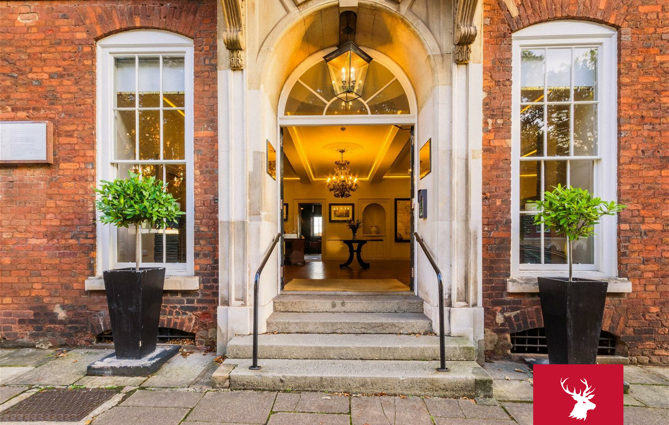
3, Dean Clarke House